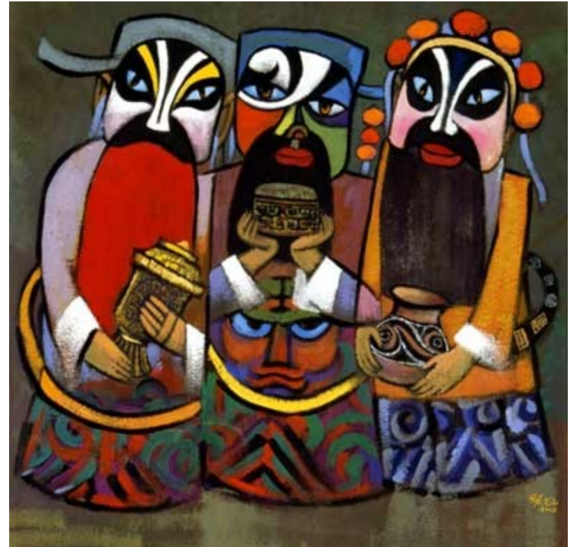
From Art in the Christian Tradition, a project of the Vanderbilt Divinity Library, Nashville, TN